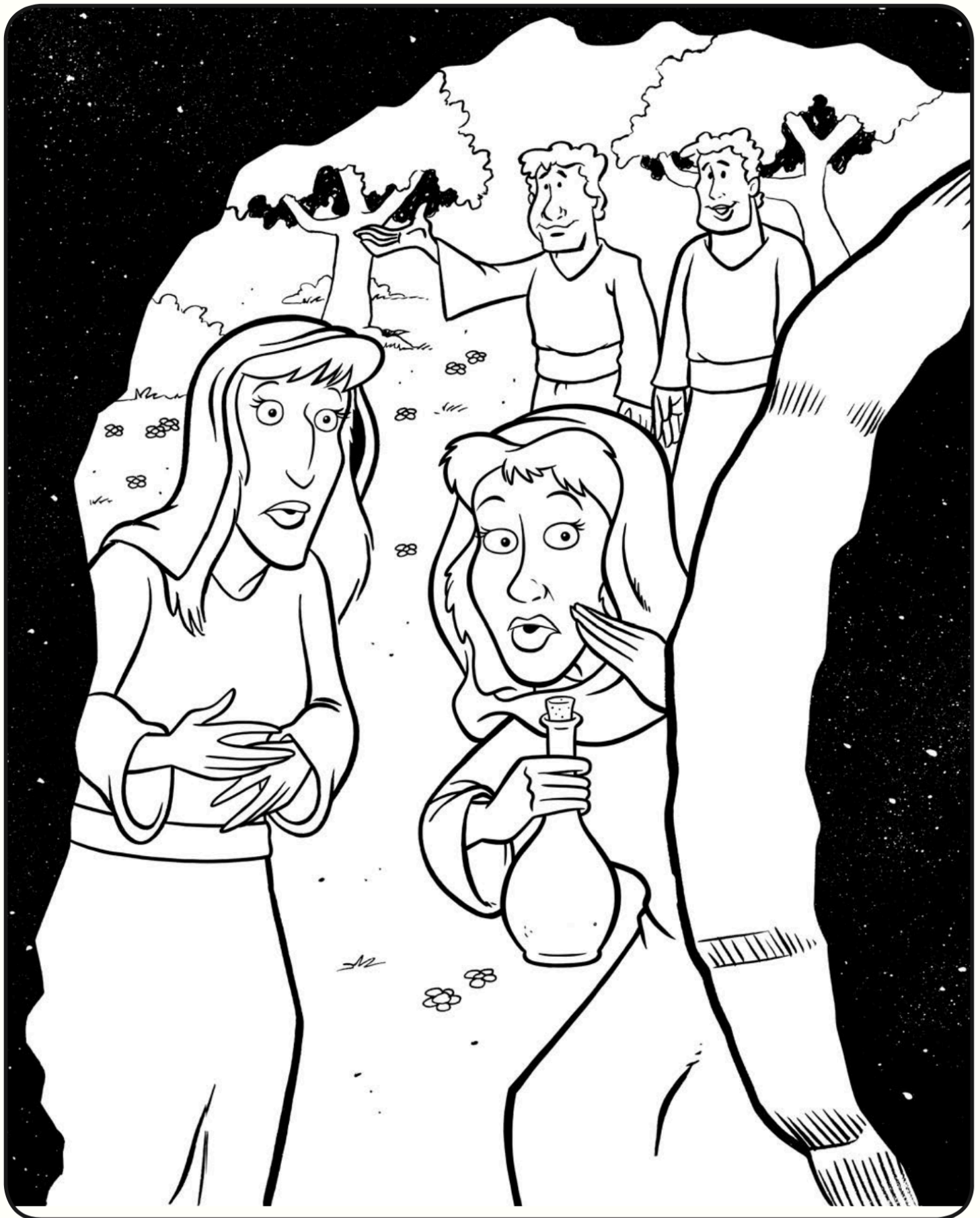
Jesus rose from the dead.